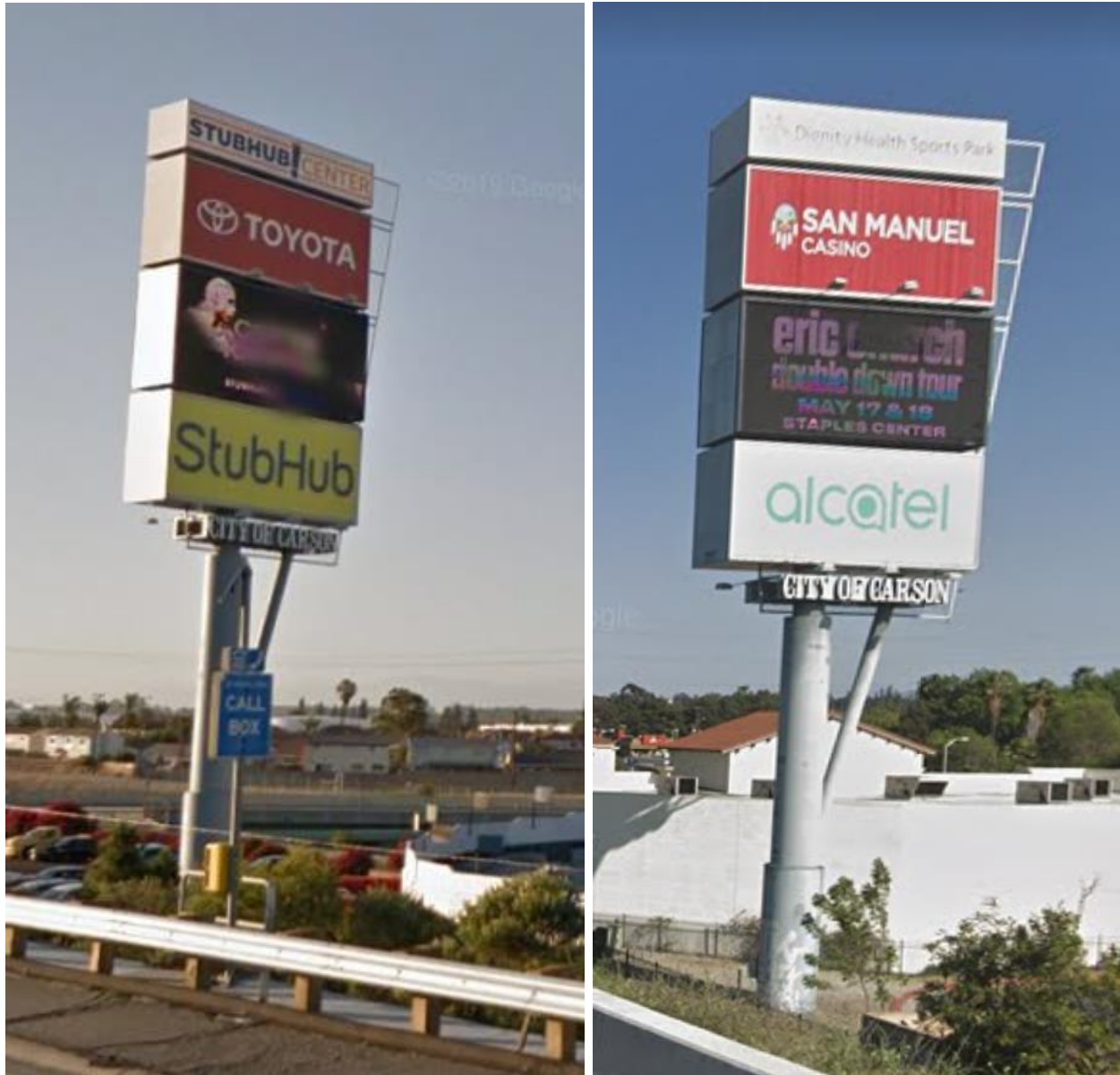
Figure 1: Existing I-405 sign (Left) Existing SR-91 sign (Right)