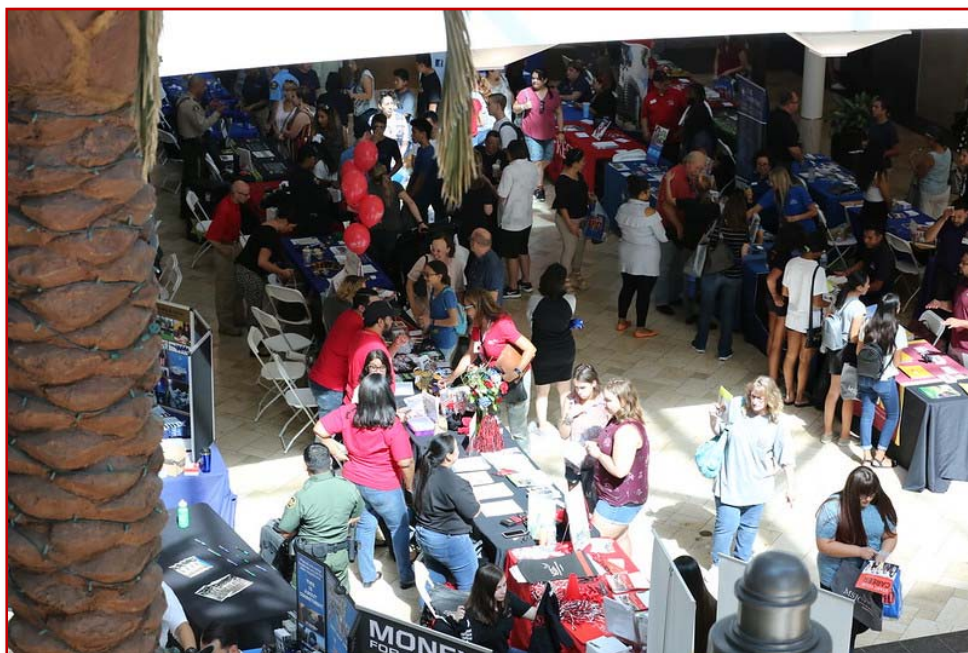
Temecula Promenade Mall, College Day (Before COVID-19 Pandemic)