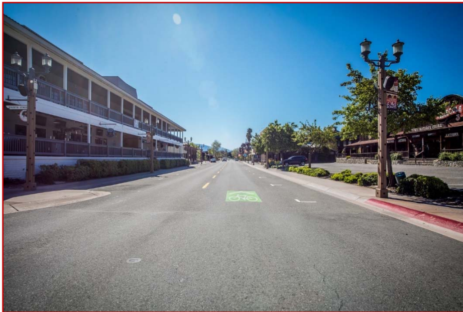
Old Town Temecula, Old Town Front Street empty (During COVID-19 Pandemic)