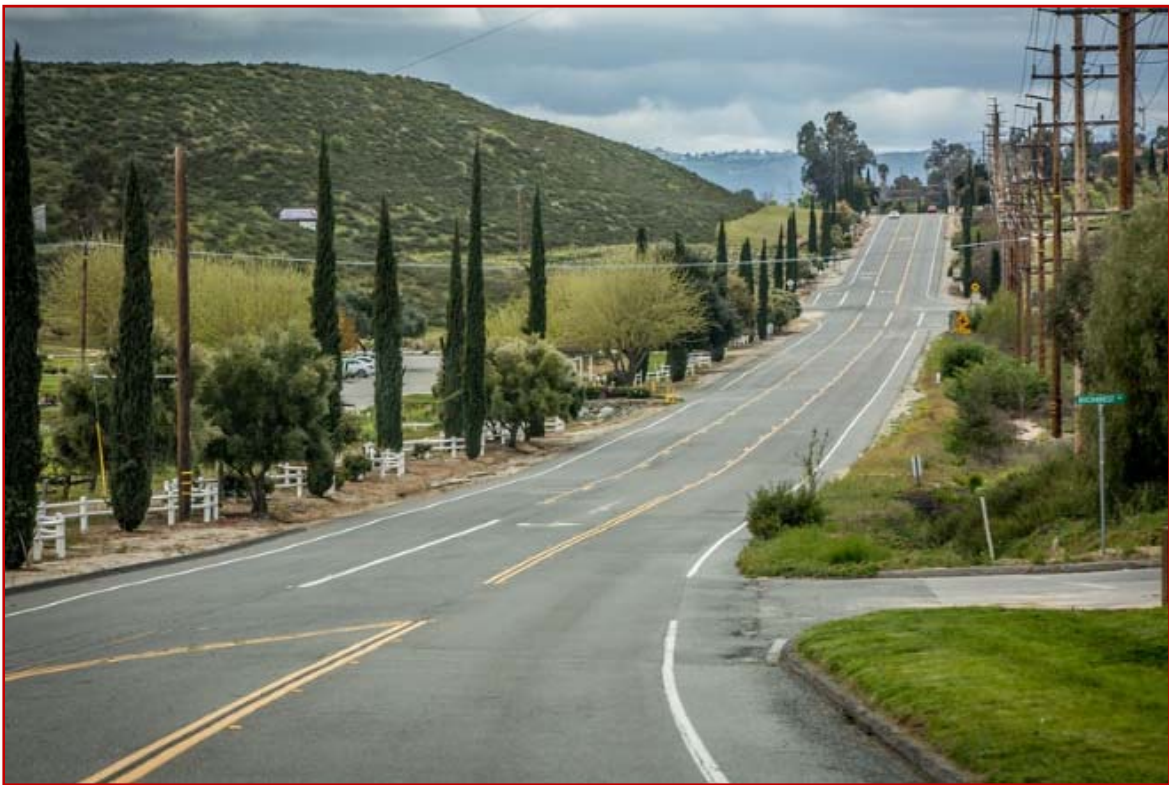
Rancho California Road heading into Wine Country void of traffic.