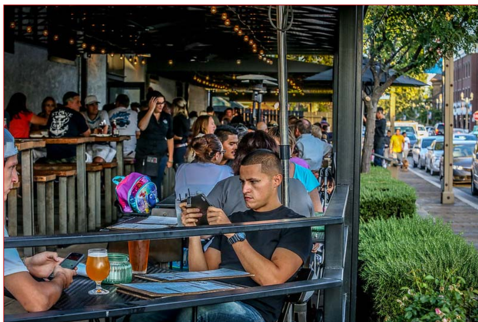
1909 Restaurant, Old Town Temecula (Before COVID-19 Pandemic)