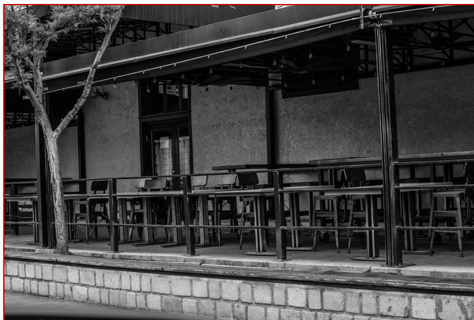
1909 Restaurant, Old Town Temecula (During COVID-19 Pandemic)