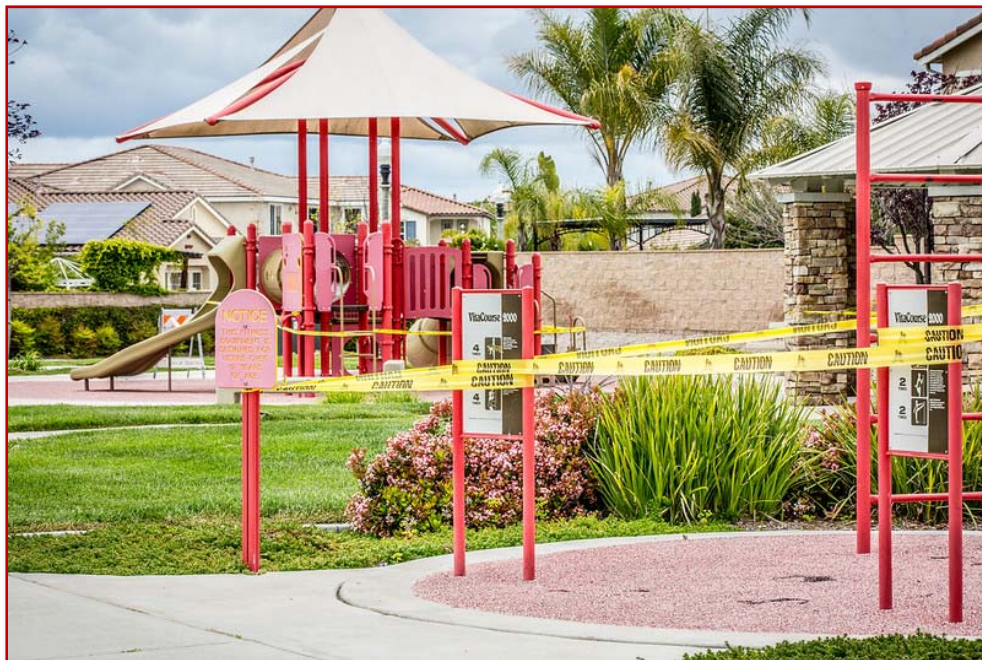
Wolf Creek Trail Park Playground closed during COVID-19 Pandemic