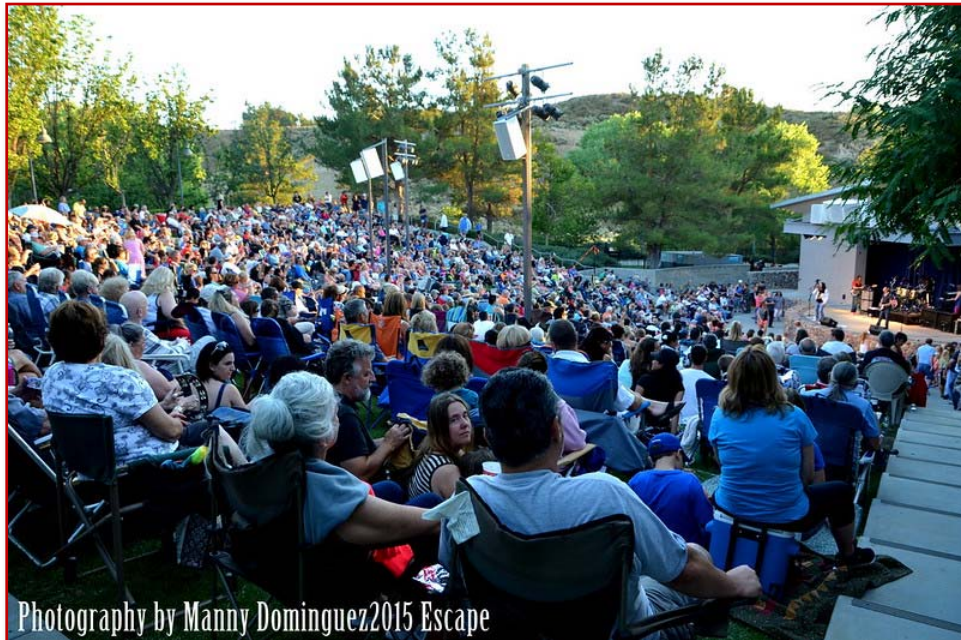
2015 Escape