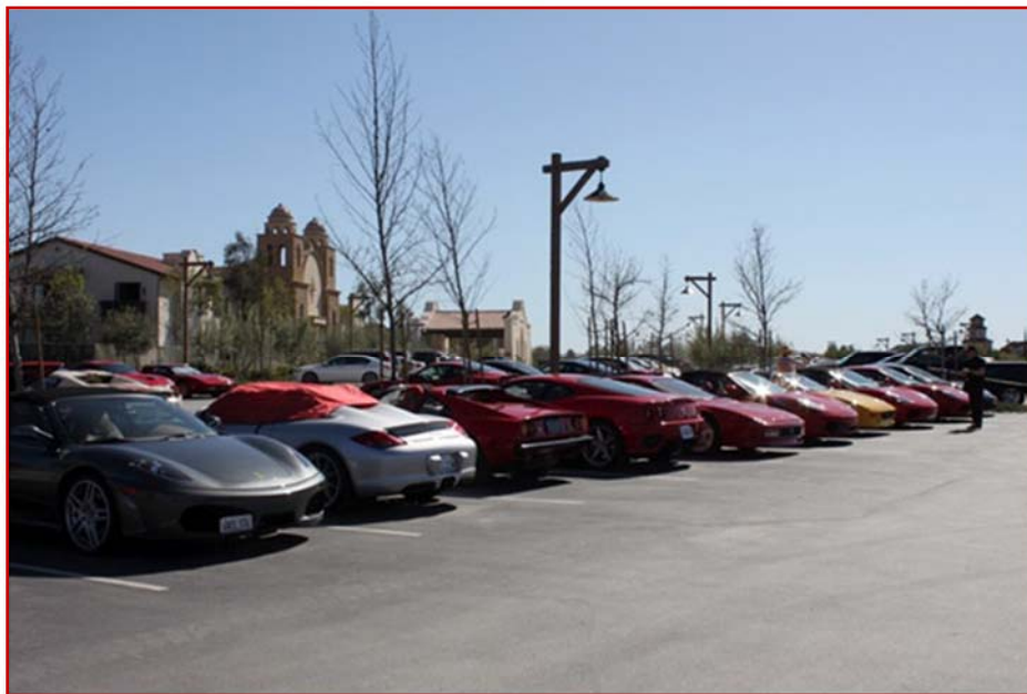
Ponte Winery on a typical weekend. (Before COVID-19 Pandemic)