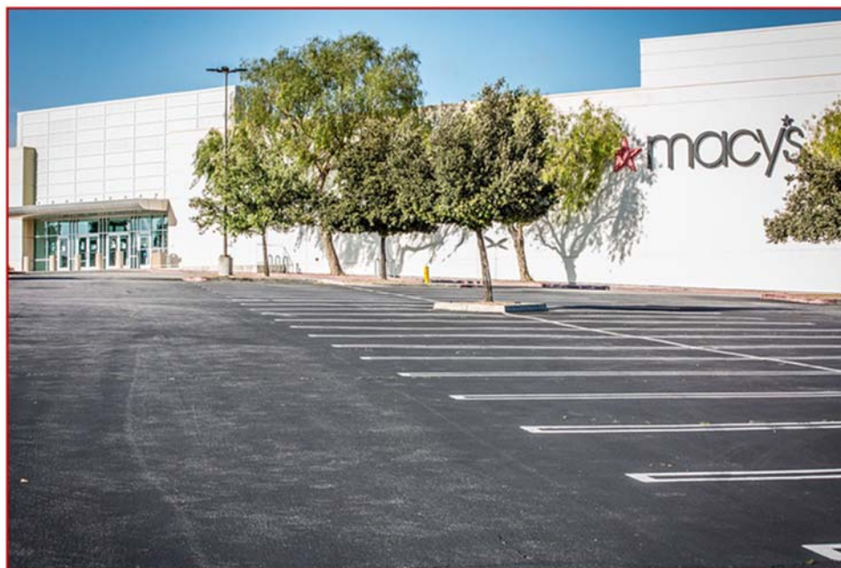
Macy's at Temecula Promenade Mall (During COVID-19 Pandemic)