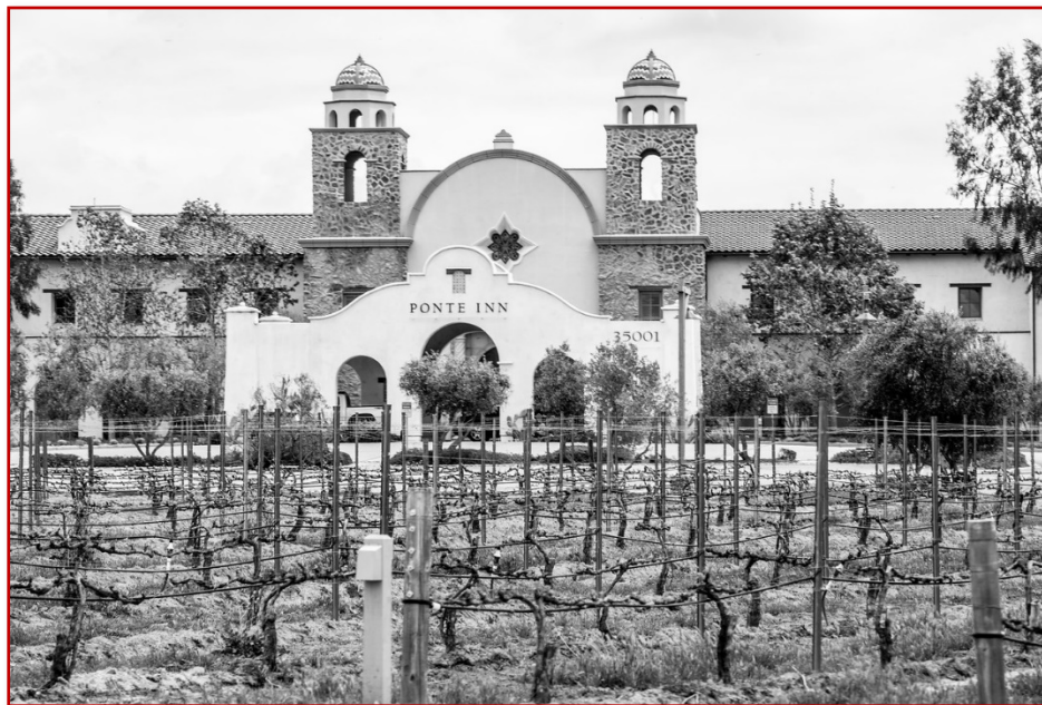
Ponte Winery sit dormant on Saturday. (During COVID-19 Pandemic)