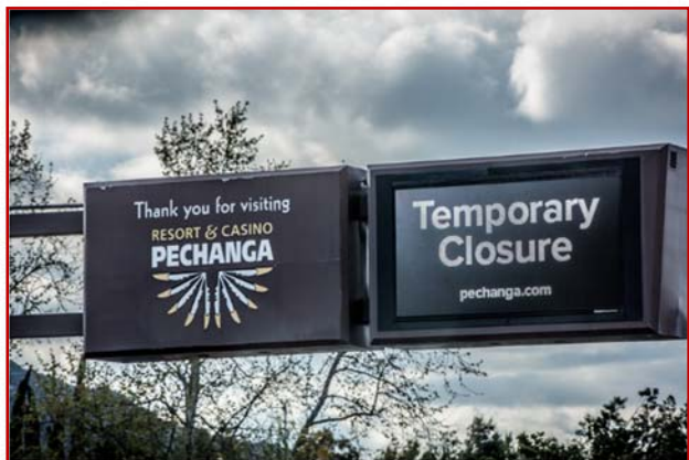
Pechanga Resort and Casino closed due to COVID-19 Pandemic