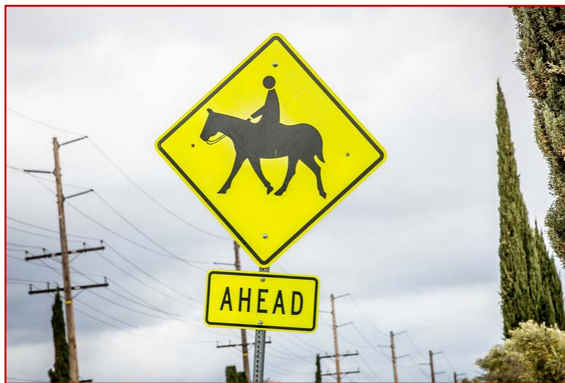
Temecula Valley's Wine Country closed due to COVID-19 Pandemic