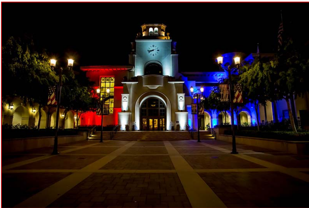
Temecula City Hall lit up Red, White, and Blue (During COVID-19 Pandemic)