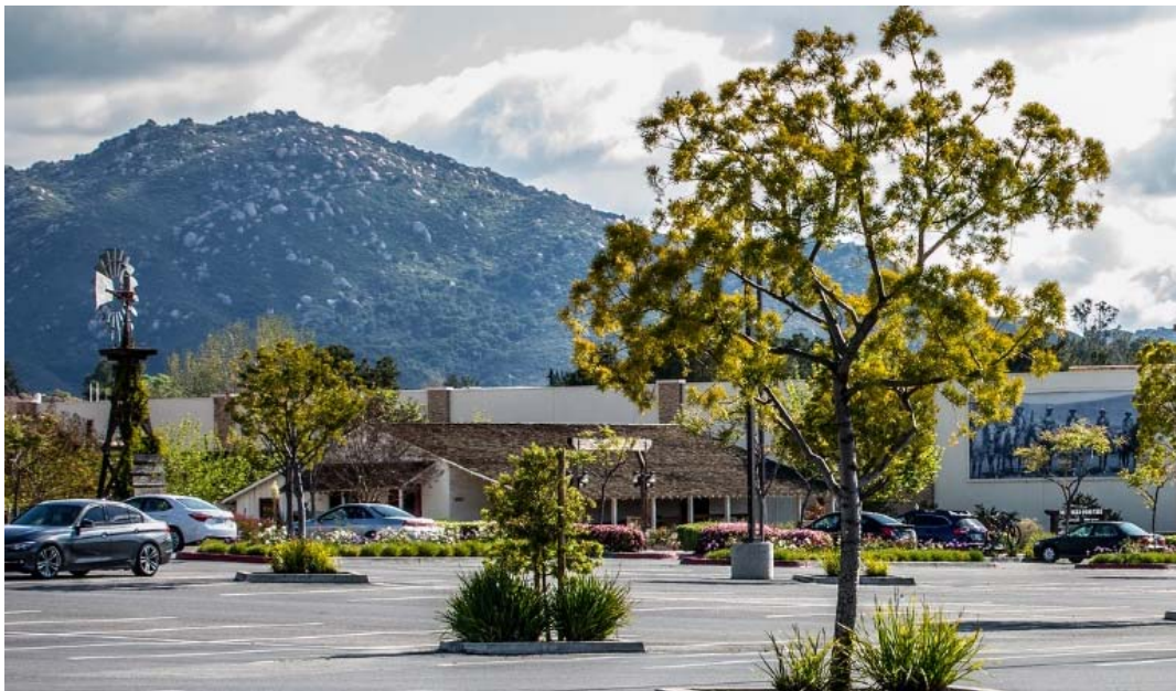
Empty lot at Vail Ranch complex (During COVID-19 Pandemic)