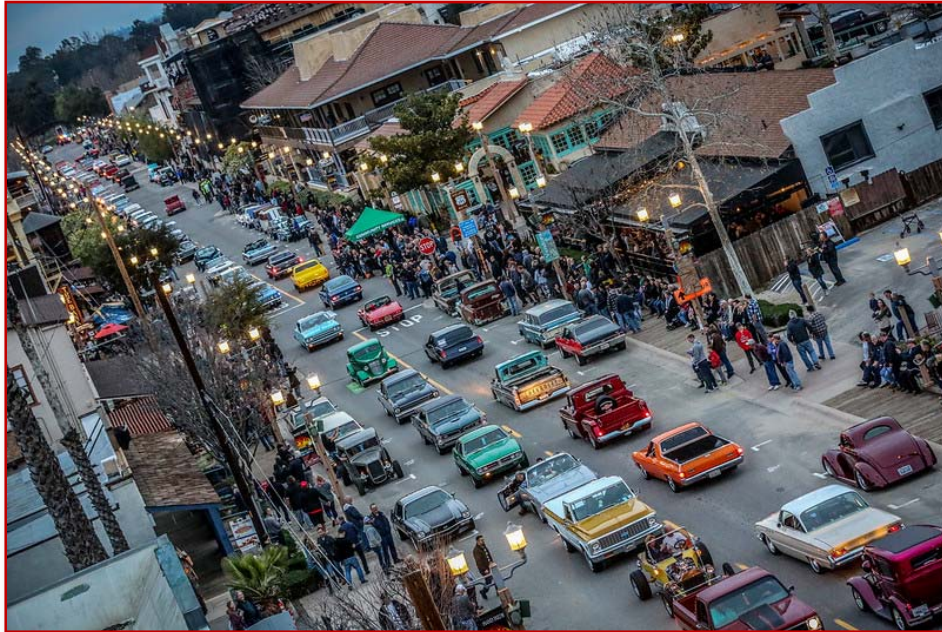
Temecula Rod Run, Old Town Temecula (Before COVID-19 Pandemic)