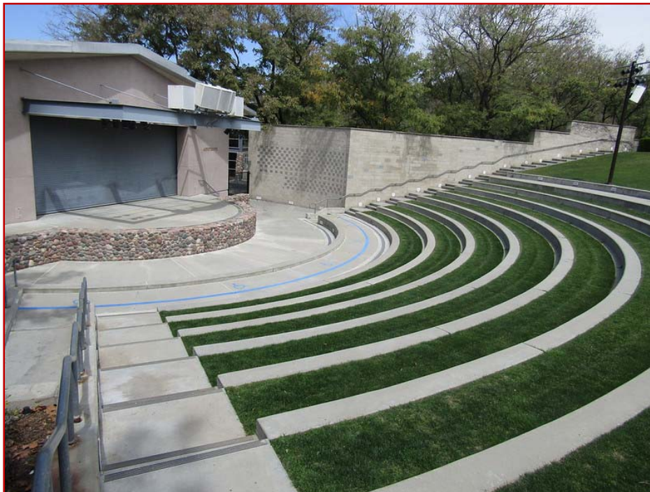
CRC Amphitheater Empty (During COVID-19 Pandemic)