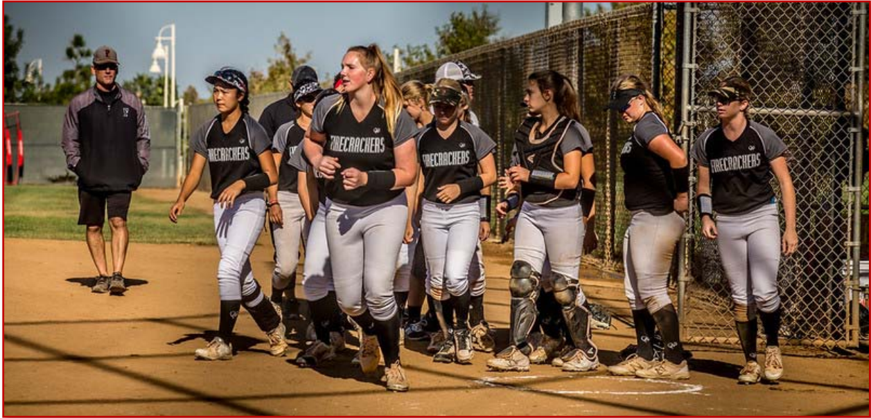
Softball Team playing on sports fields at Patricia H. Birdsall Sports Park (Before COVID-19 Pandemic)