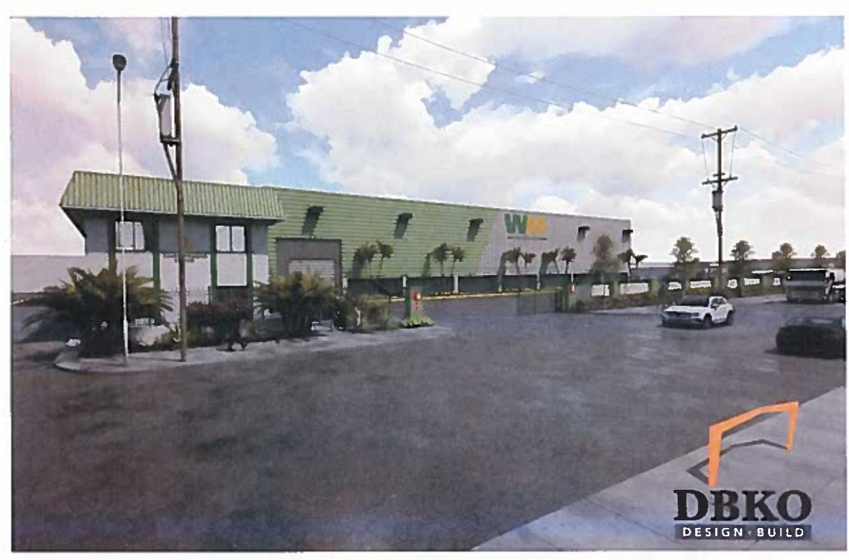
Transfer Station Renderings