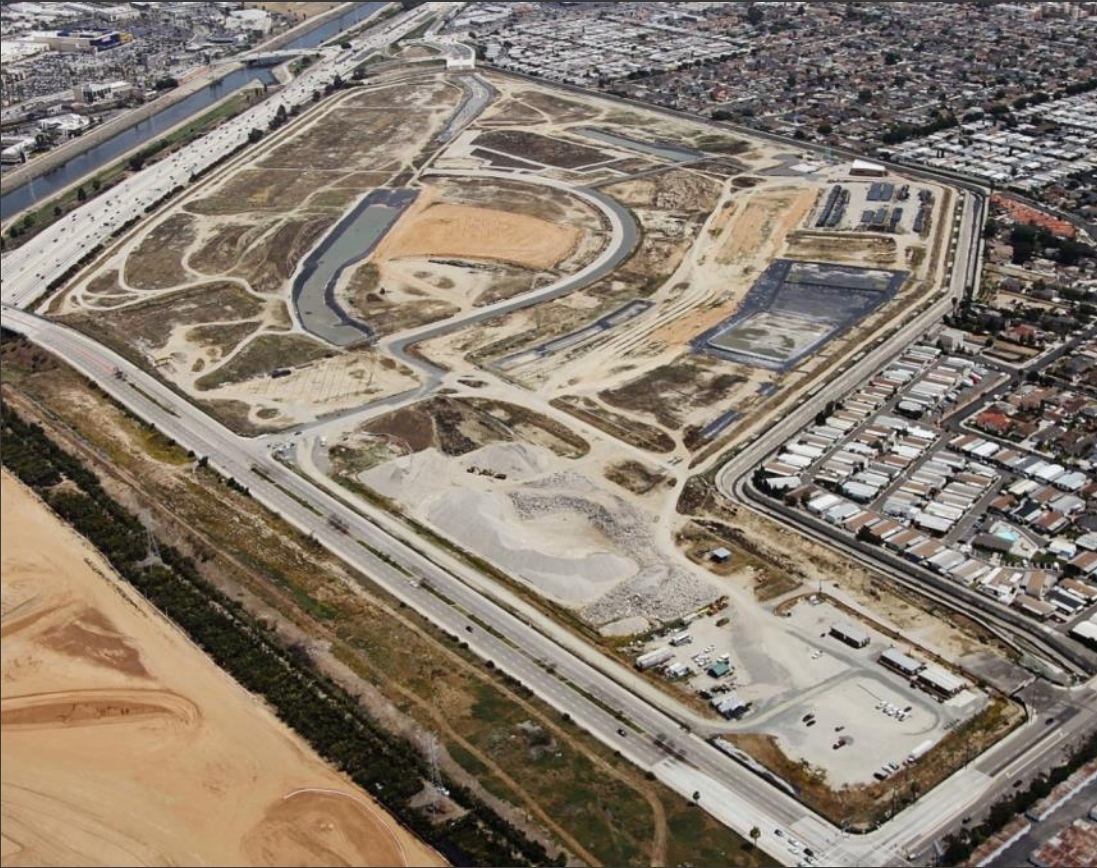
Former Cal Compact Landfill seen from the northwest