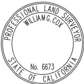
EXHIBIT "B" attached and by this reference made a part hereof.