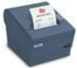
EPSON T-88V Thermal Receipt Printer Thermal Receipt Paper