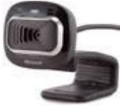
Microsoft LifeCam HD-3000