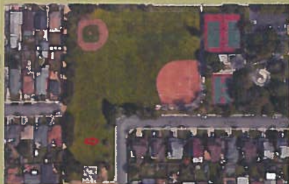
Calas Park potential dog run site About 30' x 150'