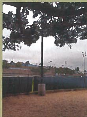
Polliwog Park Dog Run About 25' x 200' "Off Leash"