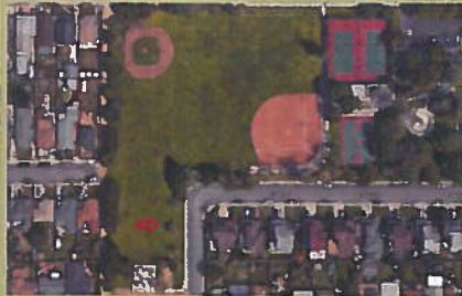
Calas Park potential dog run site About 30' x 150'