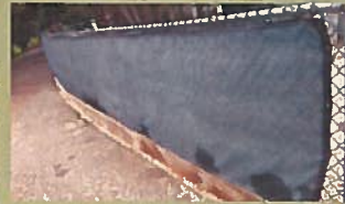
Polliwog Park Dog Run About 25' x 200' "Off Leash"