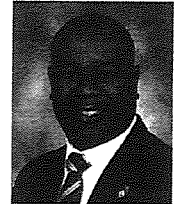
Jawane Hilton Mayor Pro Tem