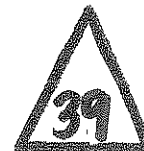
EXHIBIT NO. 5