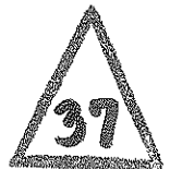
EXHIBIT NO. 4