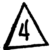
EXHIBIT NO. 1