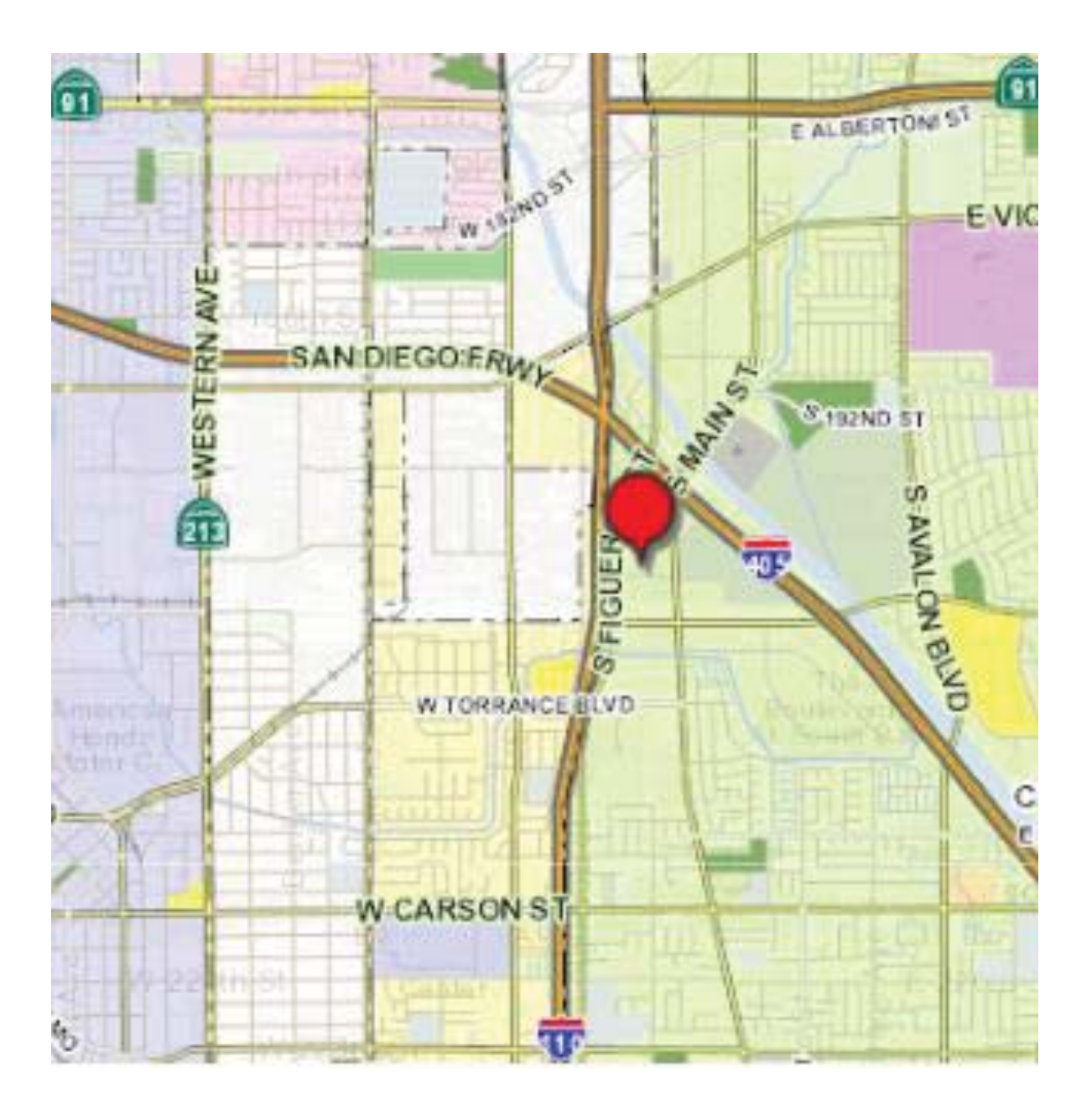
EXHIBIT B SITE LOCATION MAP