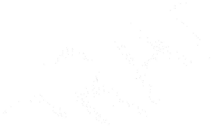
EXHIBIT "C" CITY FACILITIES