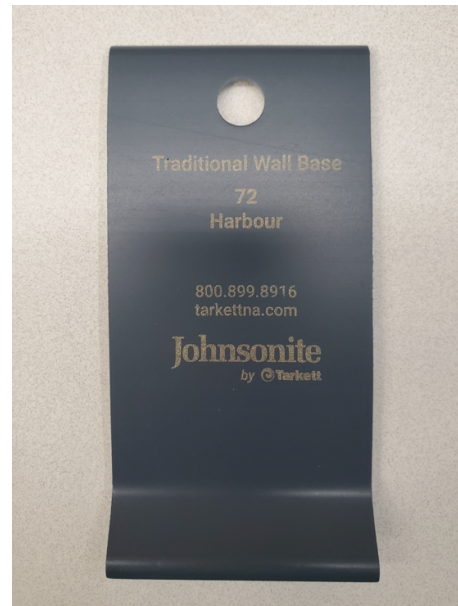
PROPOSED BASE (HARBOUR 72)