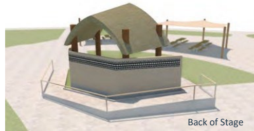
Back of Stage