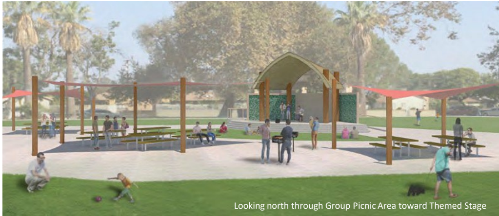
Looking north through Group Picnic Area toward Themed Stage