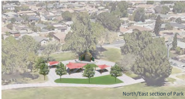
North/East section of Park