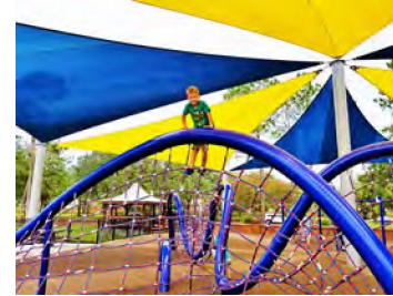
Children's Play Area 2