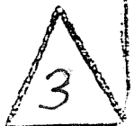
EXHIBIT NO. 01