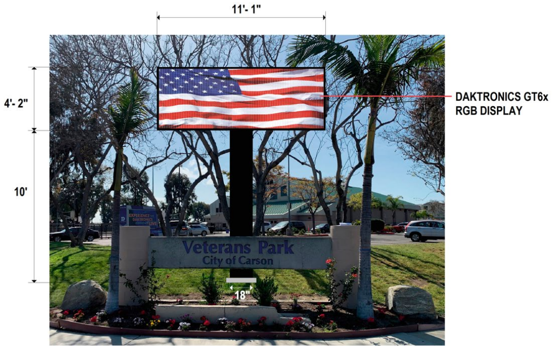
S/F MARQUEE POLE SIGN / 1/4"=1'- 0" OPTION "B"