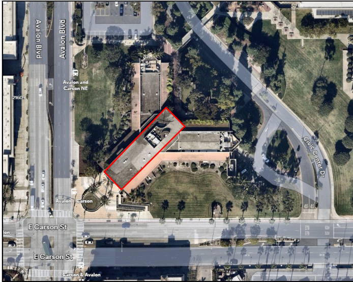
Exhibit No. 1