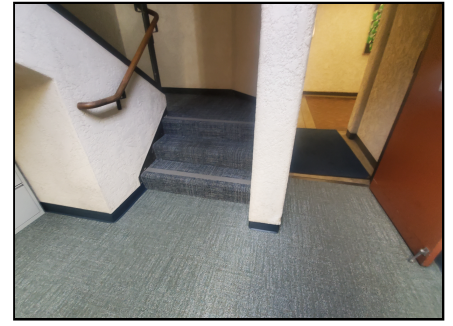
Southwest Stair Room