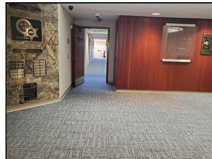
2nd Floor Lobby