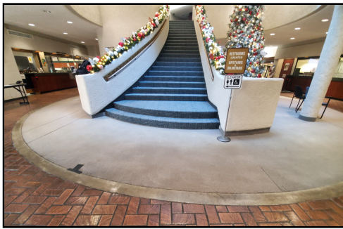
1st Floor Lobby