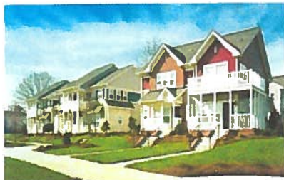
HOUSING and COMMUNITY